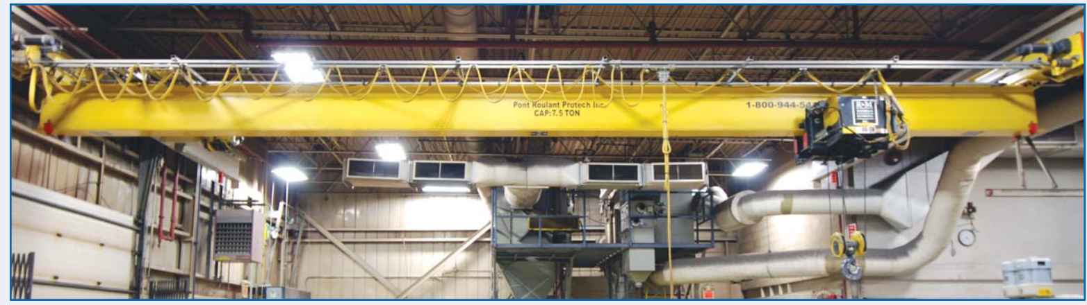
PROTECH 7.5 TON single girder underslung overhead bridge crane with approximate 37.5 ft. span, R&M SPACEMASTER SX 7.5 TON underslung hoist with pendant control s/n 915-22-A